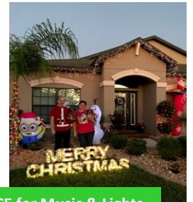
THE WEBSTER FAMILY, 3RD PLACE for Music & Lights