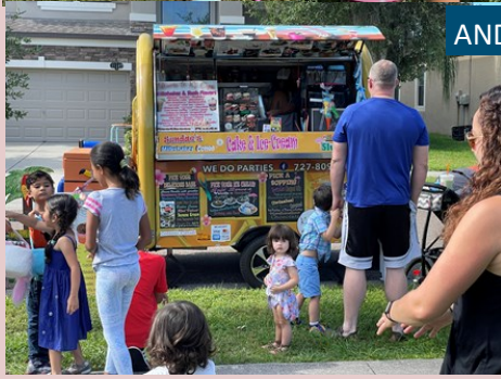
AND THERE WAS ICE CREAM