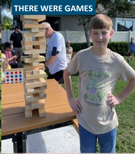
THERE WERE GAMES