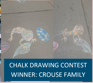
CHALK DRAWING CONTEST WINNER: CROUSE FAMILY