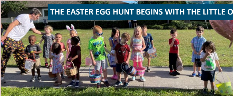
THE EASTER EGG HUNT BEGINS WITH THE LITTLE ONES