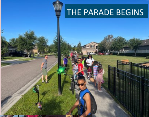
THE PARADE BEGINS